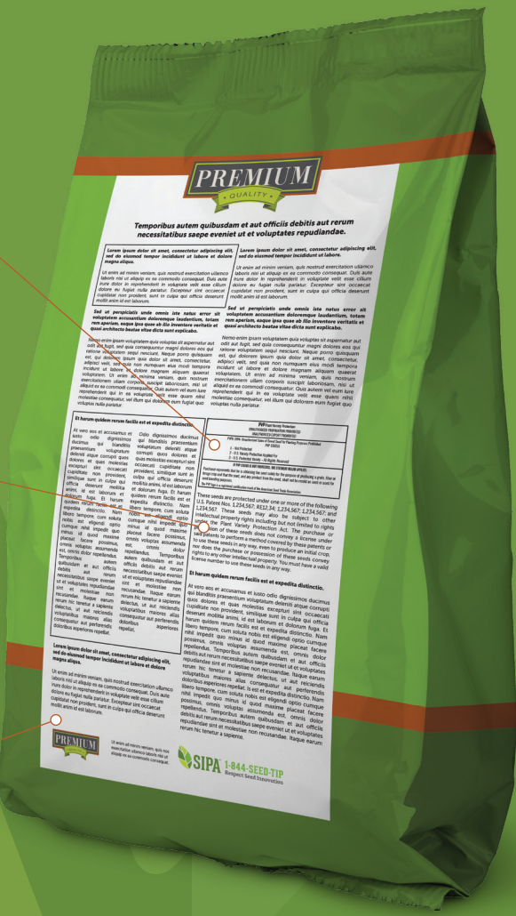
Certified Seed Label Example